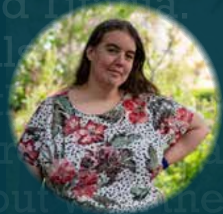
HIPPOLYTA / MUSTARDSEED